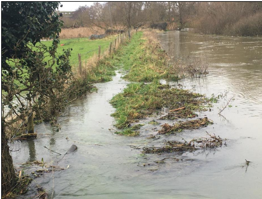
The Lark near Lackford in December 2020

The floods had an impressive impact on the river and it was very interesting to see how well our restoration works stood up, particularly at Fullers Mill. We were able to go back to Fullers Mill in the autumn to take stock of the progress and improve on our hard work carried out before the Covid pandemic and the floods struck