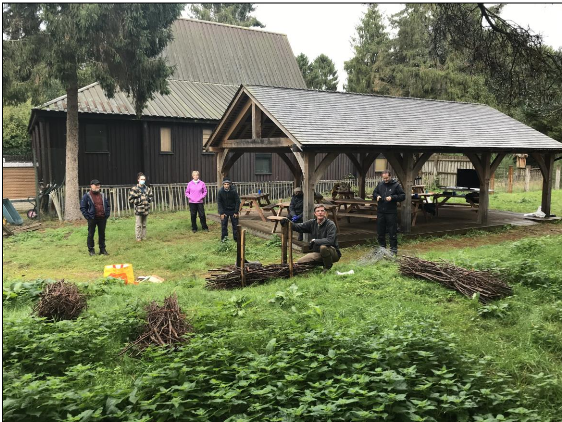
Outdoor training (Covid safe) at West Stow

In July we carried out our annual basic River Restoration training at the outdoors venue at West Stow Country Park. The training was over two sessions for twelve volunteers.