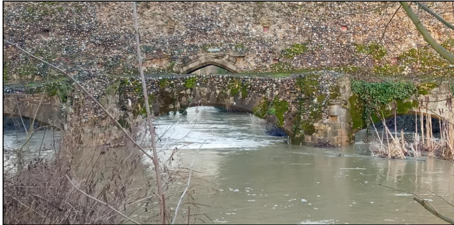
The River Lark at the Old Abbey Bridge in January 2022

A big feature of the year's progress was the big floods we had in December and January which were events we experience every decade or so.