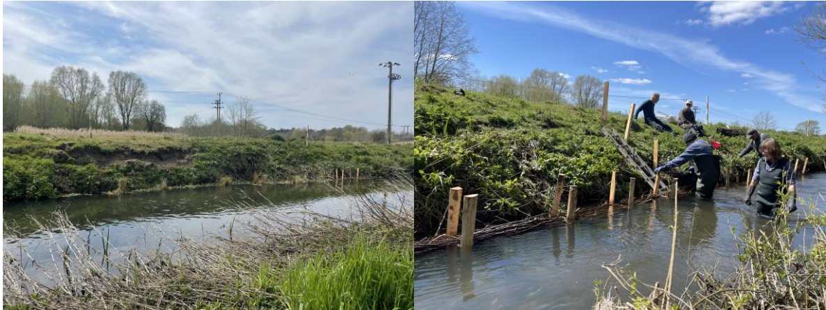
Setting about restoring the river bank downstream of Flempton Bridge in April

The year's river restoration works programme within the Brecks Fen Edge & Rivers Landscape Partnership Scheme (BFER) was blighted by the Covid restrictions in 2021 with the lockdown from the start of the year through to May effectively wiping out our main period for the year for these activities. Despite this we still managed to carry out initial works at Flempton Bridge with three very restricted work parties in April and May.