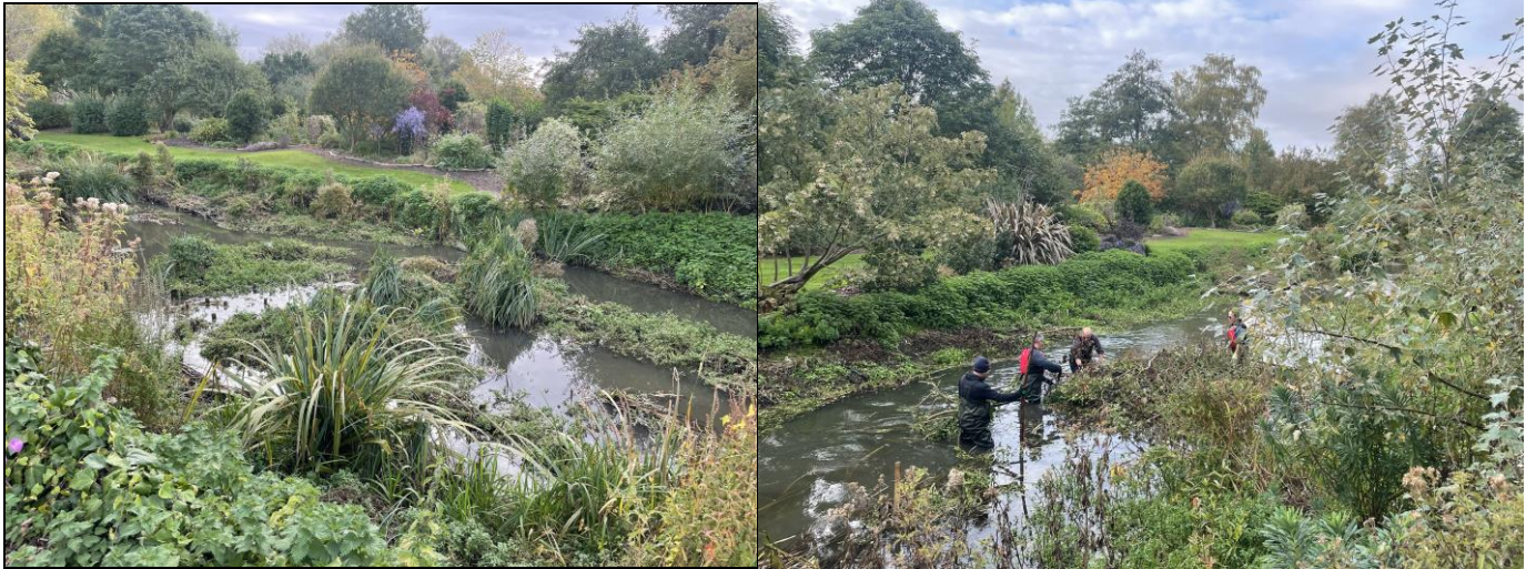
The river at Fullers Mill later in 2021 re-establishing the brush island

In July we carried out our annual basic River Restoration training at the outdoors venue at West Stow Country Park. The training was over two sessions for twelve volunteers.