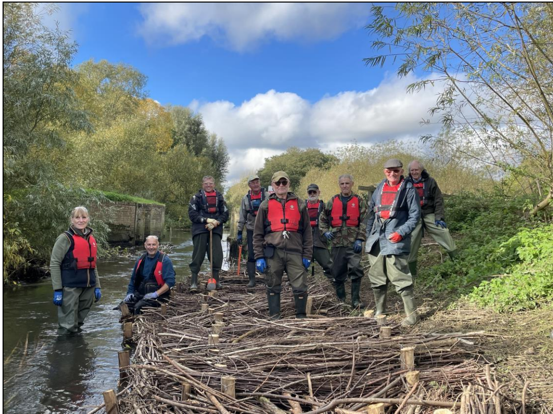
A beautiful autumn day at West Stow

The picture was brighter later on in the year as we emerged from Covid restrictions and we were able to carry out very effective works with restricted volunteer work parties at West Stow in collaboration with Bury Trout Club and at Fullers Mill.